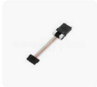
MT-Mini MT Fiber Optic Patch...