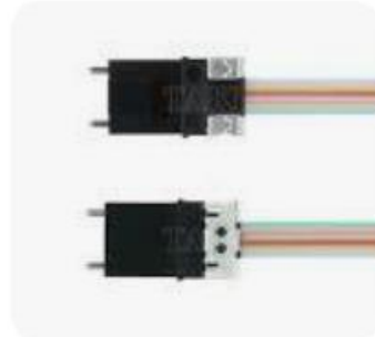
MT-Mini MT Fiber Optic Patch...

Optic Patch Cord: High-performance patch cords suitable for various networking applications.