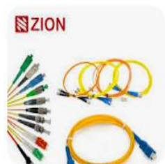
Fiber Patch Cord SC LC FC ...

12F MPO LC and DX: 12-fiber MPO to LC duplex connectors for high-density connections.