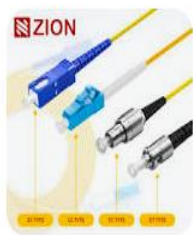
Fiber Patch Cord SC L...