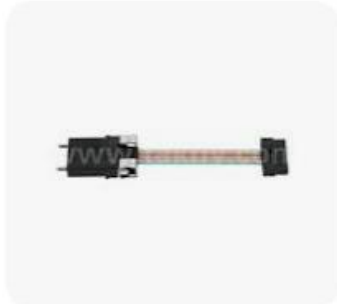
MT-Mini MT Fiber Optic Patch...

MT-Mini MT Fiber Optic Patch Cord: Compact design, lightweight, and easy to install.